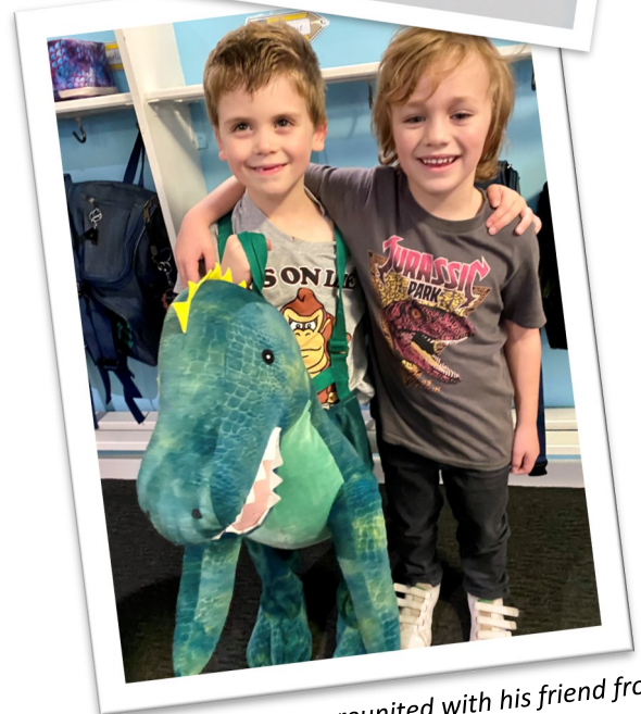
A friendly dinosaur reunited with his friend from Jurassic Park at the Disco!