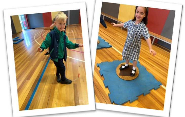
Showing off our balancing skills in PMP!